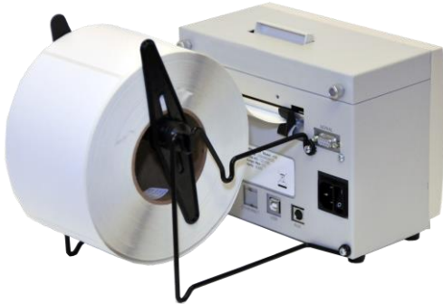
Pictured with optional media supply holder.