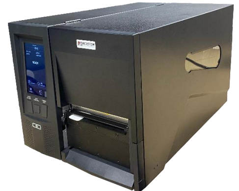
Microcom Tx3 EXP RFID Label Printer

You can add our Tx3 EXP RFID Label Printer to easily print and encode generic retail labels, complete with the EPC logo. The software remembers the serial numbers so you will not produce duplicates.